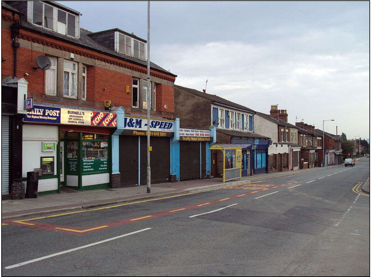
Rock Ferry, an area of Birkenhead on the Wirral Peninsula, England — Mary Amelia St. Clair, known by her pen name of May Sinclair, was born in Rock Ferry in 1863.