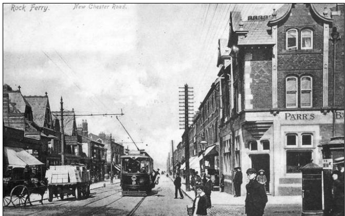
Rock Ferry, c. 1895